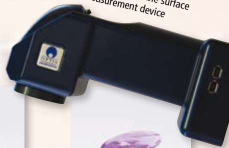
SQUALE : portable surface measurement device