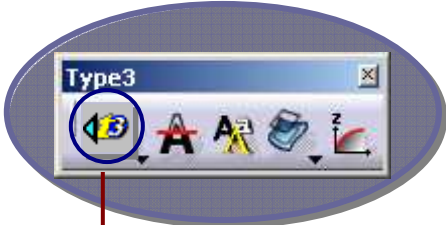
TYPE3 Copy/paste icon in CATIA V5

The gateway module allows to copy any kind of entities: Logo designs, Symbols, Text, TypeArts, Artistic 3D designs, NURBS curves, etc... between CATIA V5 and Type3