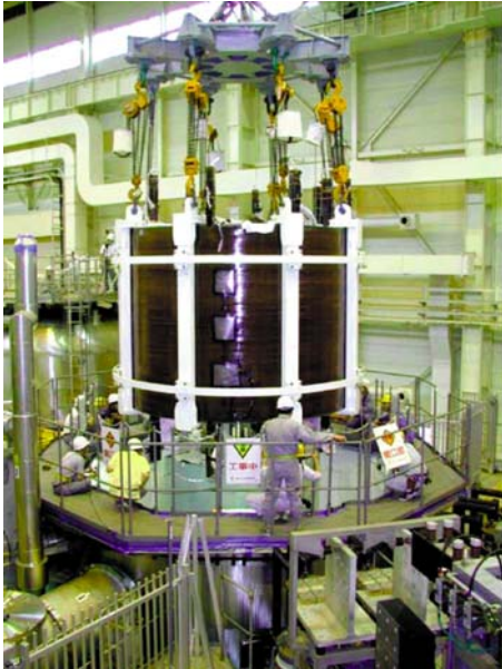
Outer coil being lowered into cryostat

All of the assembly processes have been seamlessly replicated in the 3DCS tolerance model. The method of model development and input from supporting ITER Engineers revealed that not all aspects of the design and assembly methodology were completely thought out. It is common that the process of creating a 3DCS Tolerance Analysis Model will identify design and manufacturing conflicts. Additionally, engineers who were relying on simple linear stack tolerance calculations were surprised to see the potential issues through the use of 3DCS. The "continuous deviation" function of 3DCS is helping ITER engineers to understand with confidence potential failures.